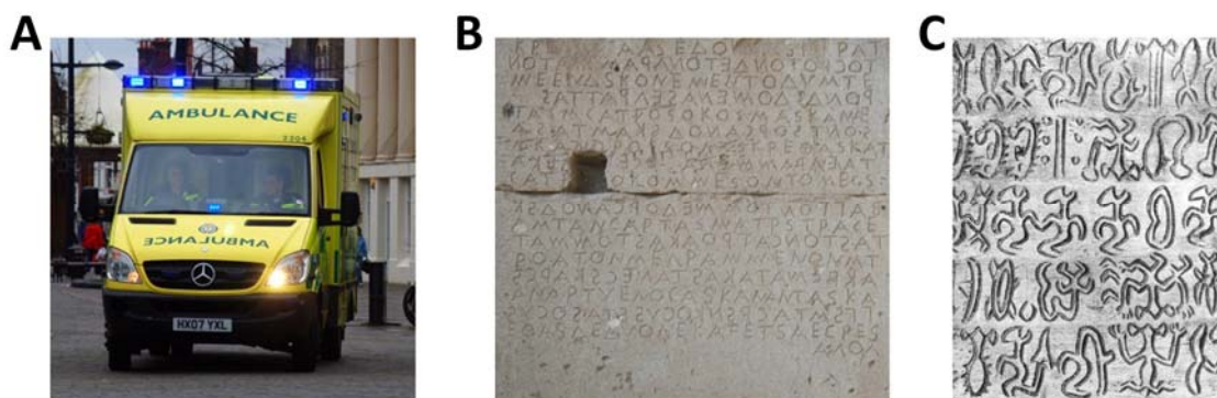
Figure 2. (A) An ambulance with mirrored text on the hood so that it appears in the correct orientation in one’s rearview mirror. By neiljohnuk from East a bit., ENGLAND! (DSC_0068) CC BY 2.0 via Wikimedia Commons; (B) Fragmentary inscription of a code of law from Gortyn (Crete). Written in boustrophedon so that alternating lines are read left-to-right and right-to-left. Each other line is left-right mirror-reversed. By PRA (Own work) CC BY-SA 3.0 via Wikimedia Commons; (C) Fragment of rongorongo script.

The fact that the mirror-reversed word “AMBULANCE” can still be read in Figure 2A suggests that the visual system may incorporate some amount of mirror invariance, at least with respect to simple single-letter or single-word representations of text. This notion is bolstered by the fact that young children often make spontaneous mirror-reversals of single letters when learning to read and write [1–4]. Typical errors include reading or writing ‘b’ for ‘d’ or transposing the position of letters in a word as in ‘was’ for ‘saw’, but also include mirror-reversals of other letters that do not form a new letter upon reversal (e.g., ‘a’). Left-right mirror reversal errors are more common than up-down errors [1,5,6]. Confusions between mirror images of letters and letter-like symbols occur when recalling symbols from memory as in writing [7], but also for matching tasks, where a child is asked to pick out a symbol that looks exactly like a target that is continuously visible, even if given explicit instructions and training to not select the mirror image [4]. These results suggest some degree of left-right mirror-invariance in children (see also [8]), which may account for why the left-right mirrored text in Figure 1B may seem easier to read than up-down mirrored text in Figure 1C [9,10].