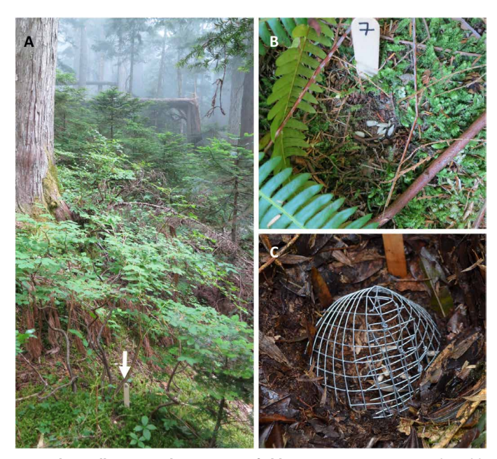
Fig. 1. Photos illustrating depot setup at field sites. Depots were not overly visible from >1 m away ( A ; arrow), as care was taken not to disturb litter and vegetation around depots ( B ). Invertebrate seed predation was assessed by excluding vertebrates from some sunflower seed depots using wire mesh cages ( C ). Photos are from 49°N in Canada at 880 meters above sea level (masl) (A) and 80 masl (B) and from 5°N in Colombia at 2120 masl (C).

We tested our predictions by systematically measuring predation on 6995 depots of standardized seeds (Fig. 1) placed along 18 elevational transects covering >4000 m of elevation and 64^{\circ} of latitude (Fig. 2A and table S1). We used one oil-based and one starch-based agricultural seed species: sunflower ( Helianthus annuus ) seeds without shells and oat ( Avena sativa ) seeds with husks (fig. S1). We ran the experiment 56 times from 2015 to 2017, with each transect tested one to six times (median = 4), always during natural seed production and dispersal at each site, so any influence of background seed crop is incorporated in our estimates. To isolate invertebrate seed