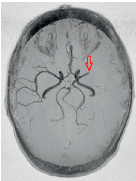
FIGURE 2: MRA brain showing total occlusion of M1 segment of left MCA (red arrow) and normal circle of Willis.

and M2 segments of left MCA (Figure 3). Also CTA neck revealed a short segment of linear filling defect in proximal left ICA, most consistent with a carotid web (Figure 4). Neuro-interventionist and vascular surgeon were consulted, and both consultants deferred any invasive procedure because of acute cerebrovascular accident (CVA), large area of infarct, and partial recanalization of the previously thrombosed vessel as evidenced in CTA. No anticoagulation was given, but clopidogrel was added. She was conservatively treated with permissive hypertension. Twelve-lead resting electrocardiogram showed normal sinus rhythm.