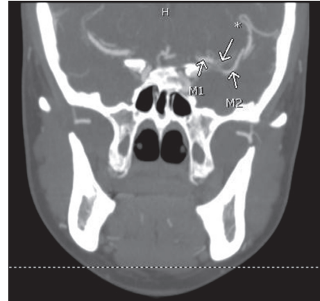
FIGURE 3: CTA neck showing a short segment of partially recanalized vessel (*) between M1 and M2 segments of left MCA.

and M2 segments of left MCA (Figure 3). Also CTA neck revealed a short segment of linear filling defect in proximal left ICA, most consistent with a carotid web (Figure 4). Neuro-interventionist and vascular surgeon were consulted, and both consultants deferred any invasive procedure because of acute cerebrovascular accident (CVA), large area of infarct, and partial recanalization of the previously thrombosed vessel as evidenced in CTA. No anticoagulation was given, but clopidogrel was added. She was conservatively treated with permissive hypertension. Twelve-lead resting electrocardiogram showed normal sinus rhythm.