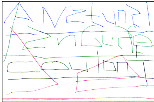
(fig. 2, Grenier, For Larry Eigner 12)

Fig. 1 appears to read “moon / letters / page” and includes a red circle with a line through it (red ink). One of his most legible drawn poems, shown in fig. 2, appears to read “A Natural / Language / couldn’t / be.” In both poems, Grenier’s self-reflexive language comments on the inevitable distance between language and nature. He clearly distinguishes the physical (“moon”) from its translation to language (“letters”) and its final placement in text (on the “page”) in fig. 1. In fig. 2, though, the later poem in the For Larry Eigner sequence, the poet dismisses the possibility of reconciling the unadulterated physical world with language as he implies that language can never be “natural.” Moving past the quest for language to express nature, the sequence embraces the immediacy of the moment and the experience in all of its mediated wonder.