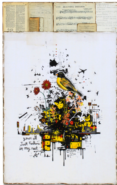
(fig. 4, Haemmerlein)

not only material factors but also the various nonmaterial memories, thoughts, emotions, and distractions that permeate the perceiver's mind, are exposed. In other areas of visual art, the union of these very elements is even more pronounced. Found poetry is perhaps the most obvious example of where visual poetry is heading in the twenty-first century. The Found Poetry Review lvi and other such forums, which are dedicated to foregrounding the poetics of everyday life, demonstrate that poetry is always present in the world and only needs to be properly contextualized in order to be received for its poetic underpinnings. Patrick Haemmerlein's work, for instance, engages with environment diversely by including not only material elements of space but also the nonmaterial subjective factors that influence the artist.